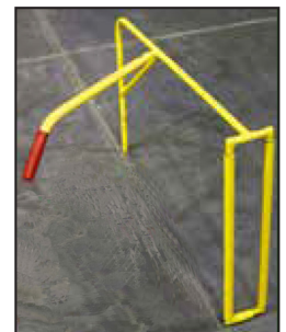
Standard manual guide arm.

Unrolling, secure your gas powered winder by the tie offs on the frame, pull the wire away from the unit slowly. Make sure the clutch is in neutral or freewheel. You may need to adjust your motor on the frame with the 4 bolts on the engine at first to get it set to free wheel without turning the engine over. You can also unroll by tying the wire to the corner post and driving slowly away with the unit secured in the vehicle you are driving as you unroll. Hotwood's is in the process of developing an unrolling arm that will work with any of our reels along with new rolls like the Red Brand you buy new wire on.