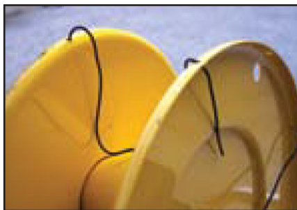
Wire tie off for wire being rolled.